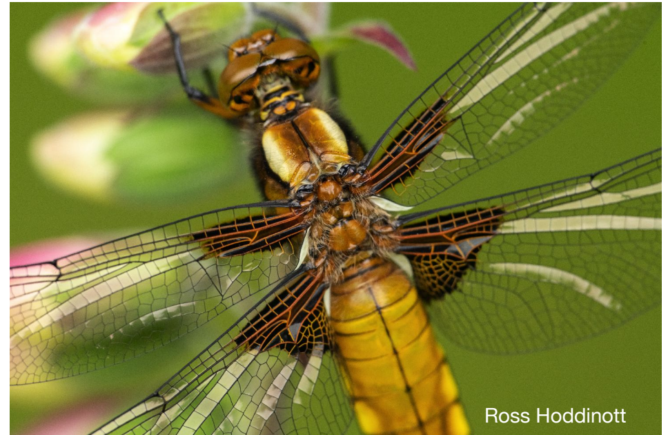
shot @ 200mm+NiSi Close up lens