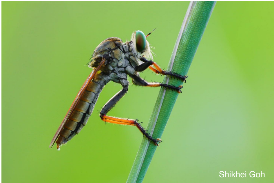
shot @ 130mm f/8+NiSi Close up lens

We recommend using the close-up lens on telephoto lenses with an aperture of f/8-f/16 to achieve the sharpest details.