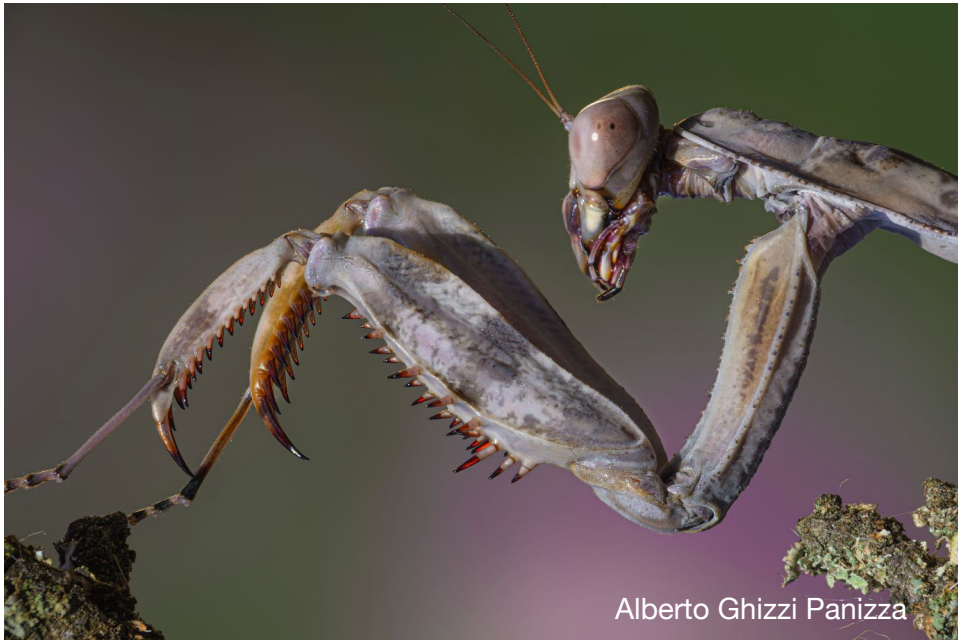
@165mm+NiSi Close up lens