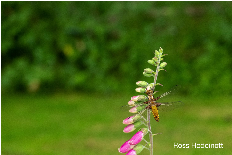
shot @ 200mm

The close-up lens is the most effective way to achieve a closer minimal focal distance. The magnification achieved depends on the focal range of the lens used, It will be higher with longer focal lengths . The magnification will be close to 1:1 when you focus at 200mm.