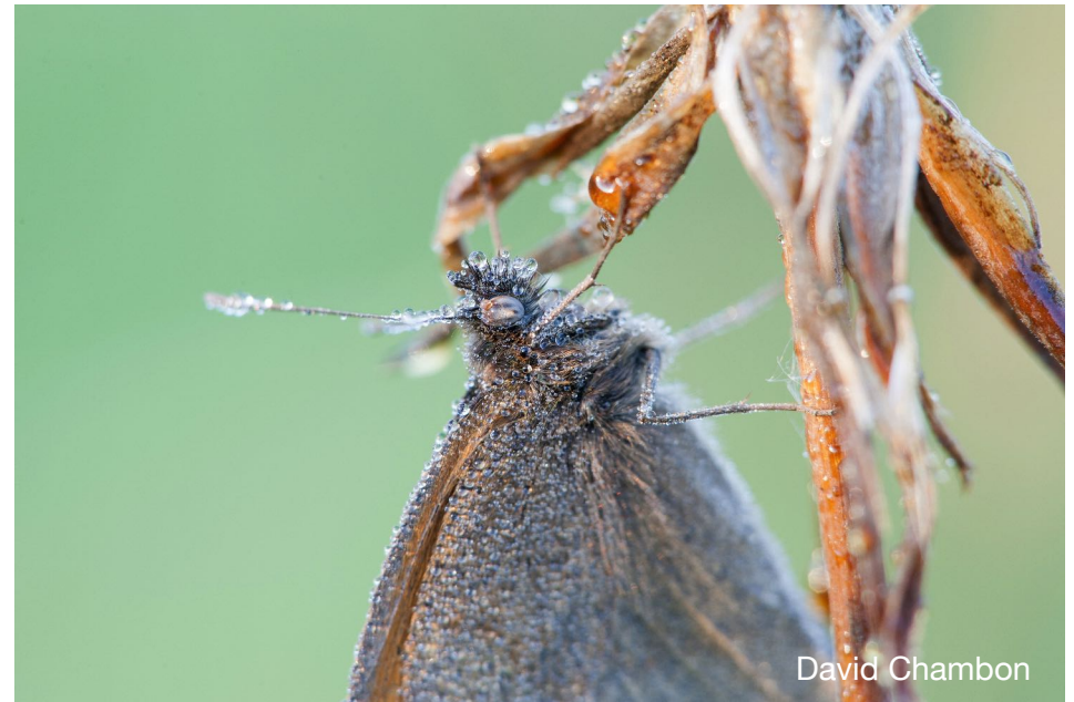
shot @ 200mm f/11 +NiSi Close up lens